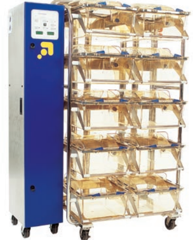
10 cage rat rack and AMU