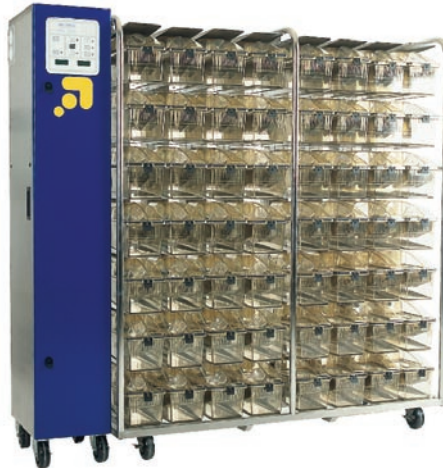
56 cage single sided rack and AMU