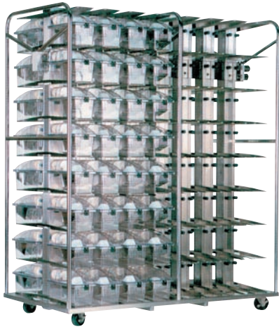
112 cage double sided rack

Our modular racking system offers complete flexibility to meet any laboratory design. The fully mobile racks with fitted AMUs are available in a wide variety of formats, ranging from 10 to 114 cages. Further racks can be added at any time, and the system allows racks to be 'daisy chained' for even more flexibility